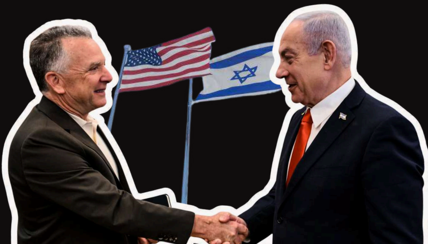
Steve Witkoff, United States Special Envoy to the Middle East, and Benjamin Netanyahu Prime Minister of "Israel shake hands during a meeting July 31, 2025" about Gaza aid and Ceasefire

The proposed 60-day truce included several key provisions: a phased "Israeli" military withdrawal from Gaza (moving from west to east), a halt to aerial bombardments, unrestricted entry of food and humanitarian aid, and a prisoner exchange deal. Despite great flexibility by the Palestinian resistance, "Israel" proved to only be interested in the total and complete surrender of the Palestinian people, insisting that its primary war objective, the complete dismantling of Hamas, had not yet been achieved and therefore any kind of ceasefire deal was not worth it.