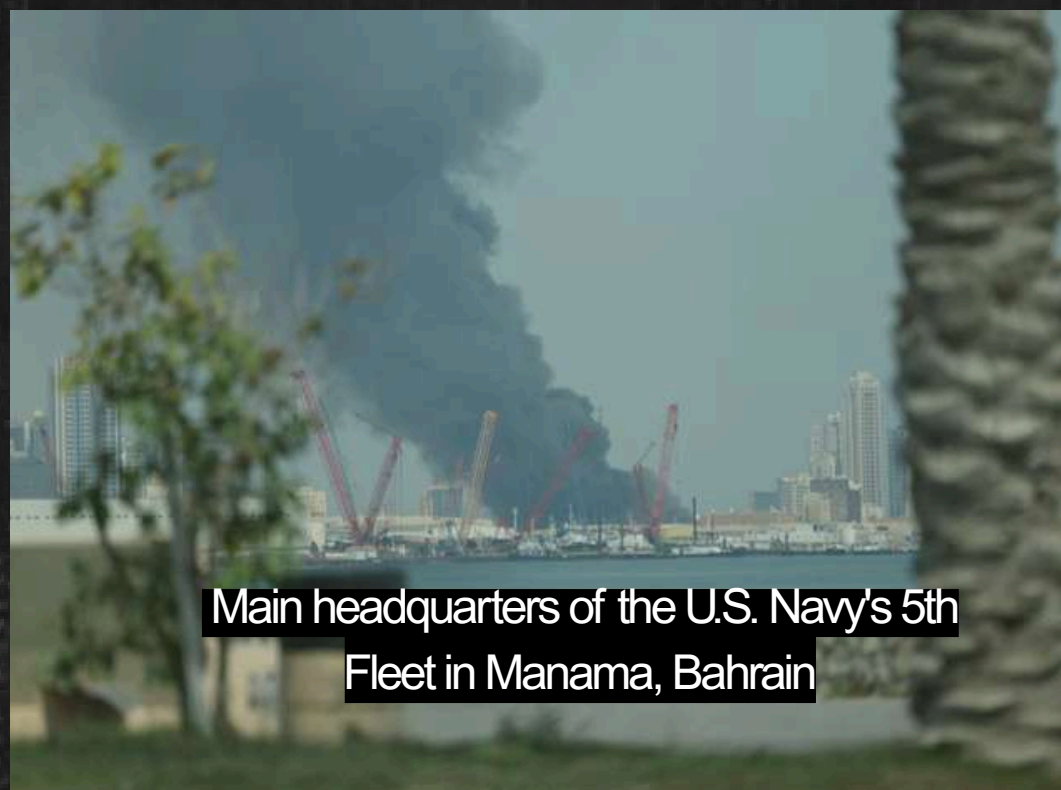
Main headquarters of the U.S. Navy's 5th Fleet in Manama, Bahrain