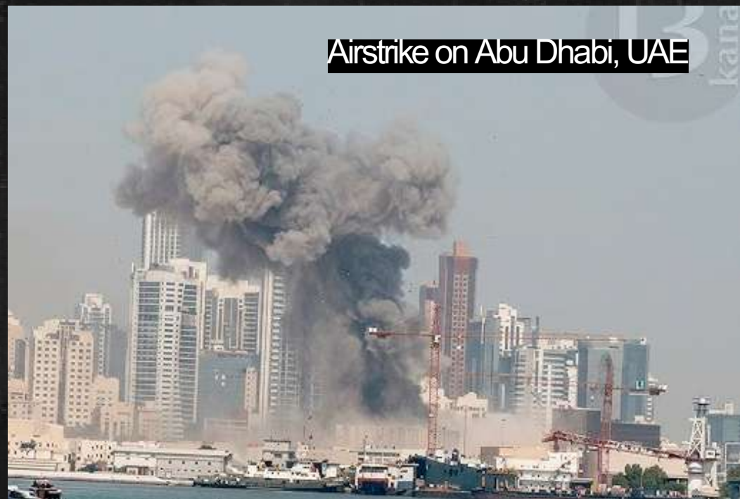
Airstrike on Abu Dhabi, UAE