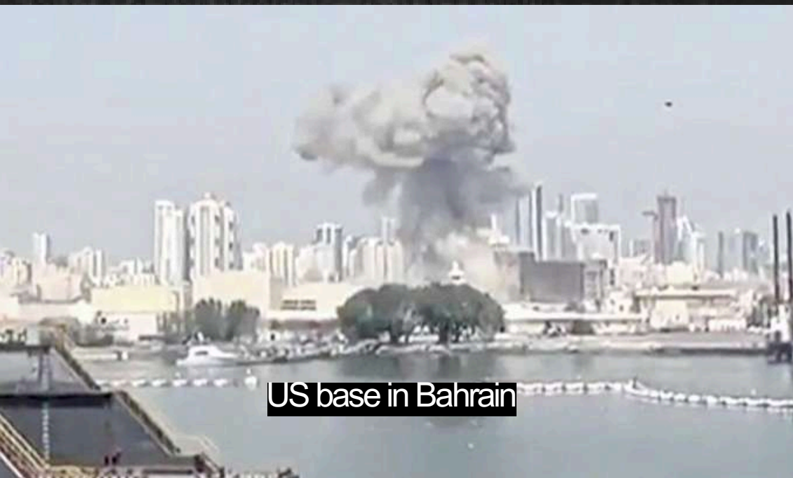
US base in Bahrain