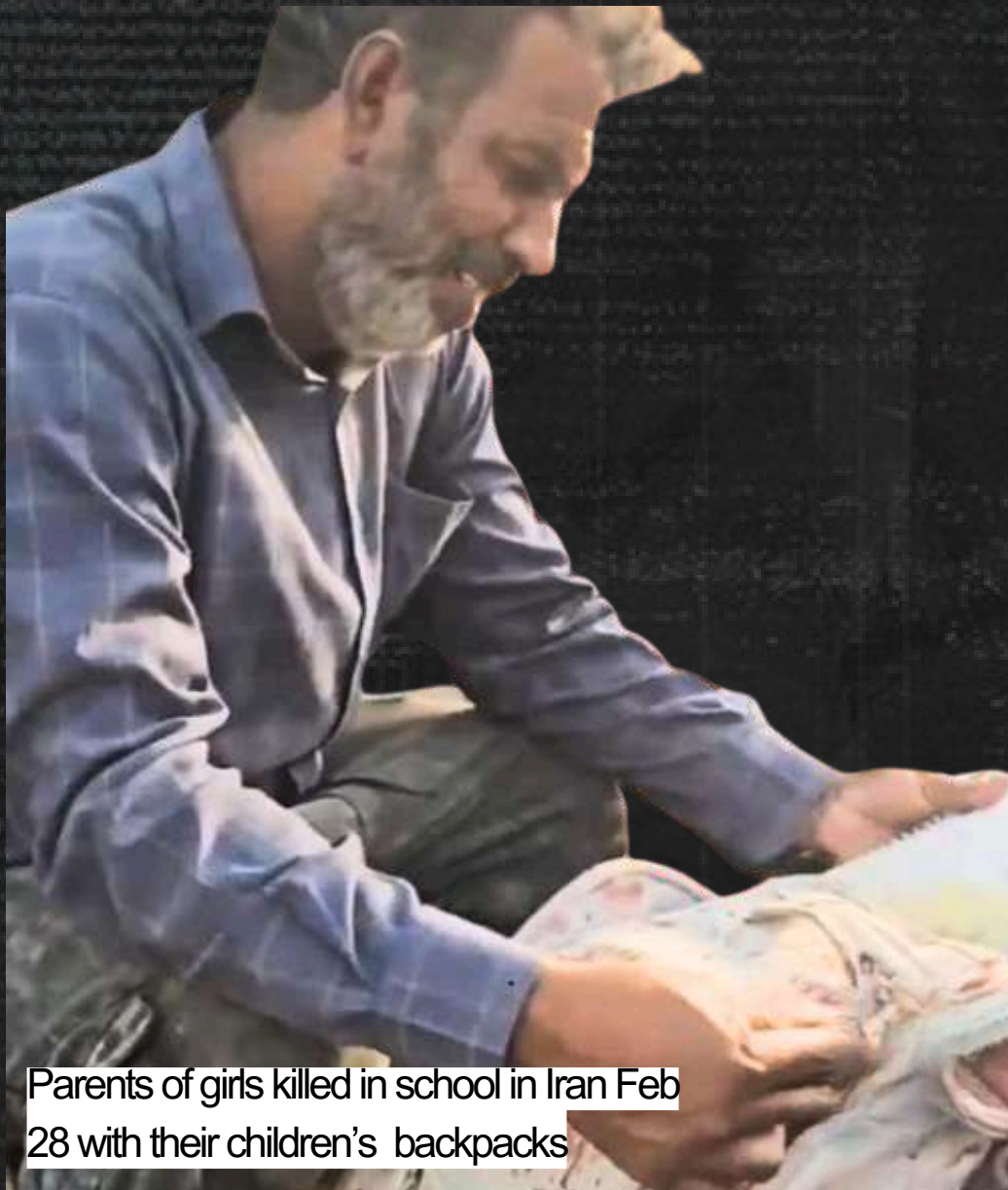
Parents of girls killed in school in Iran Feb 28 with their children's backpacks

Israel, framed by the US and its allies as liberator of women against Arab and Islamic regimes by the US, has killed tens of thousands of women and children in the past 2 years on its genocidal campaign against the Palestinian people. On the second day of war against Iran on February 28, 2026 the Zionist entity targeted a girls school in Iran, murdering more than 150 children.