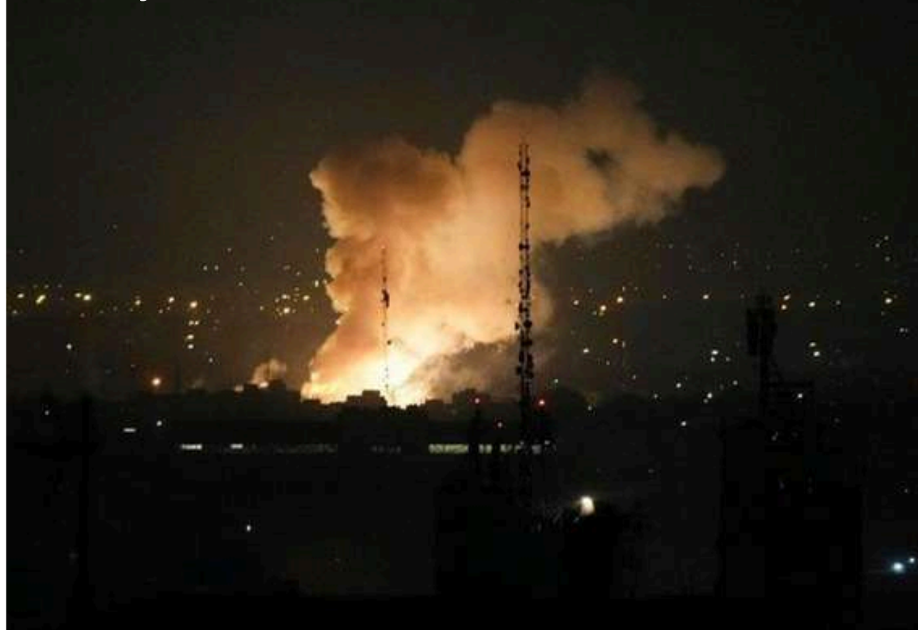
12 Day War, 2026