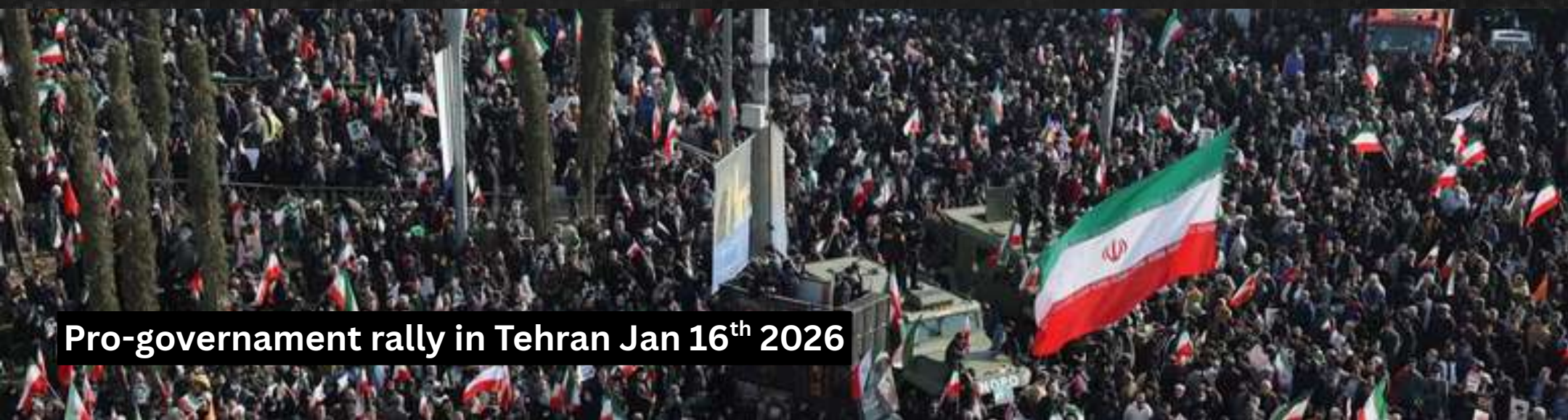
Pro-government rally in Tehran Jan 16 th 2026

The Iranian people's legitimate grievances were exploited by external actors intent on bringing more war and chaos to Iran. Many people were killed in the violence by foreign-backed provocateurs, including state police forces and healthcare workers who were burned alive. The state, in an effort to quell the threats backed by the US and Zionist entity, also used harsh measures. Western media immediately reported unfounded death tolls of 12,000–60,000 and attributed all deaths to the hands of the Iranian state without mentioning the provocateur violence. These are the same outlets that chronically and criminally under-reported the death tolls of the genocide in Palestine and have been manipulating these numbers to suit their narrative.