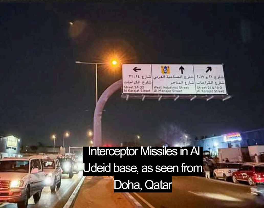
Interceptor Missiles in Al Udeid base, as seen from Doha, Qatar