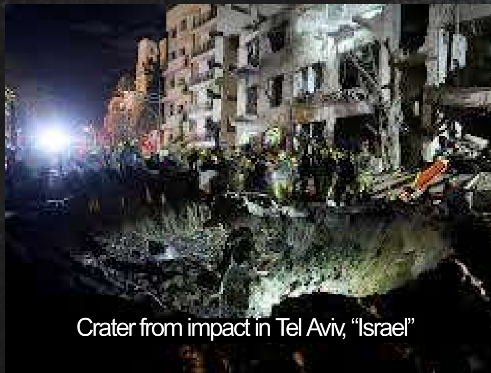
Crater from impact in Tel Aviv, "Israel"