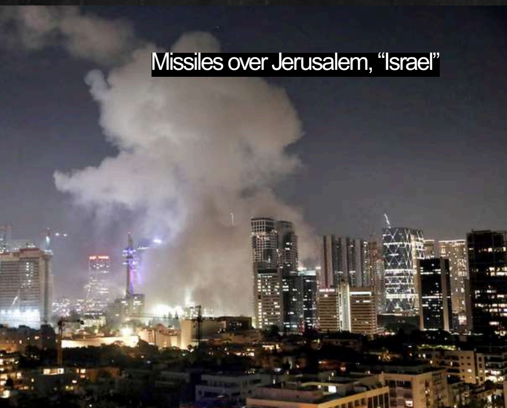
Missiles over Jerusalem, "Israel"